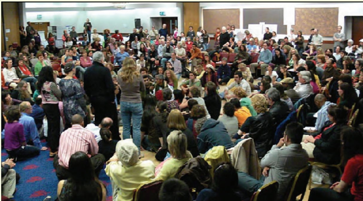
More than 420 people attended Worldwork 2008, London

selves, “a moment arises when growing together become possible”, Mindell says. “Whenever war is the issue, the polarized positions are often avoiding conflict on one side and grief and frustration on the other. Without facilitation, frustration leads to anger, rage, and retaliation...The solution to war is not peace but growing together.”