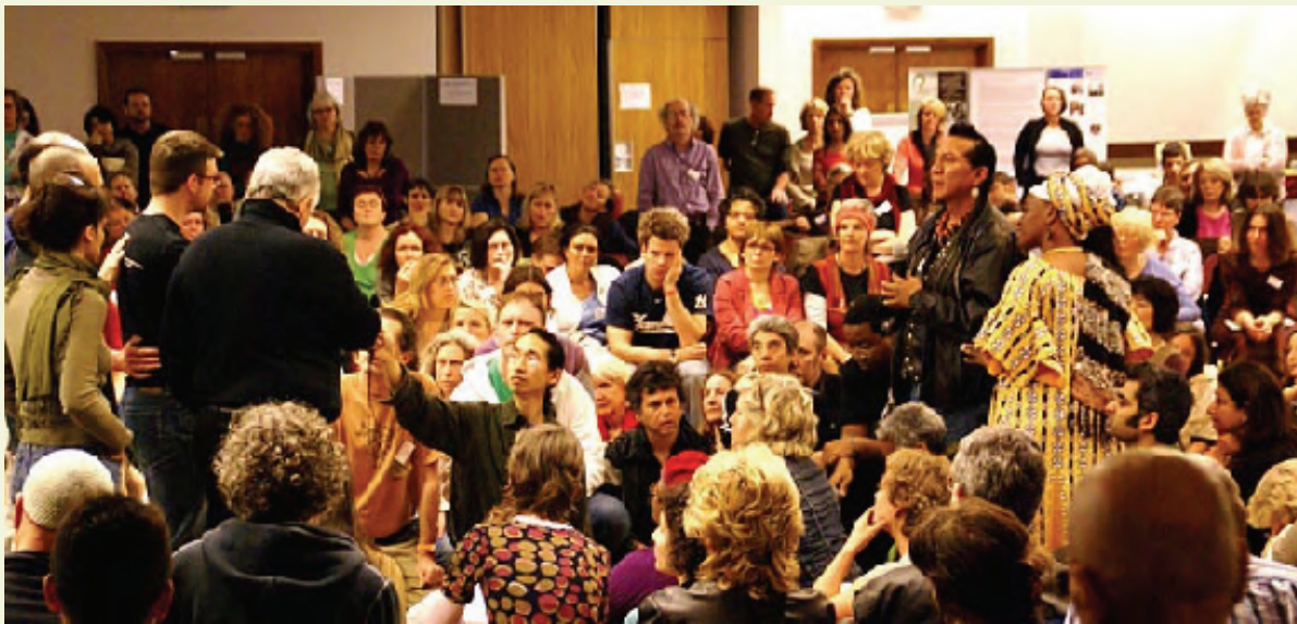
Group work in the centre of Worldwork 2008, London