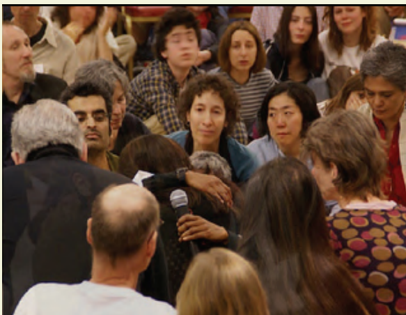
Group action is dynamic.